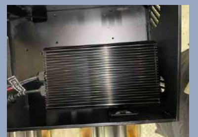
Built-in charger, charging is more convenient