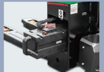
Easy for exchanging battery