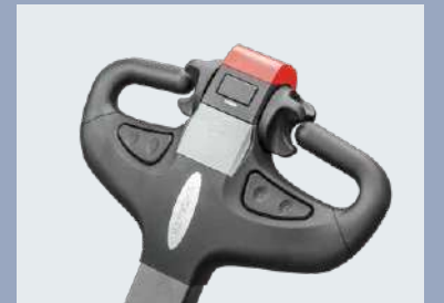
The modular tiller is simple but reliable and beautiful, all parts inside it can be replaced separately and all operations can be done easily with one hand