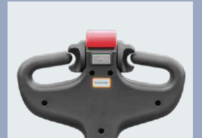
The upright-tiller running function allows it to work within confined space, such as container