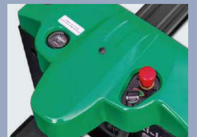
Body feature smooth lines and affluent sense of movement, and compact profile, in accord with the latest appearance design trend